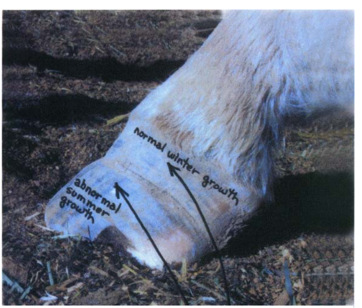
Above: (Perfectlydun Bonanza.) Baby Doe's odd hoof growth. Image shows normal winter growth and abnormal summer growth. During the winter of 2003/2004 the horses choose to eat the snow, rather than drink the fluoridated tap water.

looked forward to her favourite producing a foal but when it happened there was cause for disappointment. Baby Doe's colt was extremely immature and cryptorchid (that is he had only one testicle). He did survive and was named Winning Gold Bonanza, Win for short. Shortly after birth he developed lumps under his skin, he urinated a lot and, as he grew, his hips appeared swollen. He was unsteady on his feet and often stumbled because his joints gave way causing his legs to go out from under him. By the year 2000, Baby Doe was suffering from continuous infections, thyroid problems, misshapen bones and hooves, joint problems, lameness, constant profuse urination and difficulty breathing. She exhibited the classic symptoms including the hairiness of 'Cushings Disease', (Equine Metabolic Syndrome).