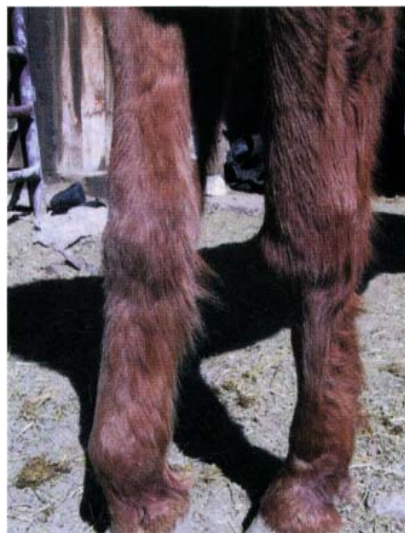
Above: Bird's deformed front legs